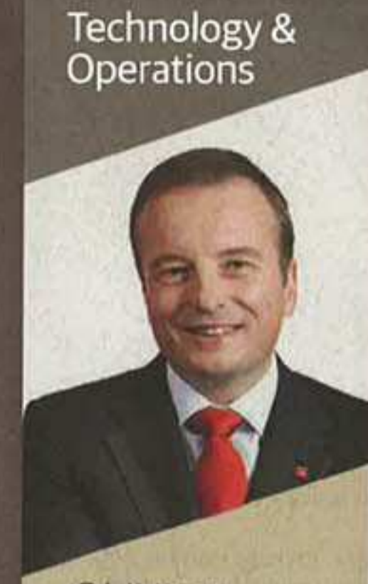
Technology & Operations