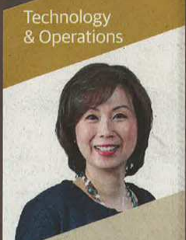
Technology & Operations